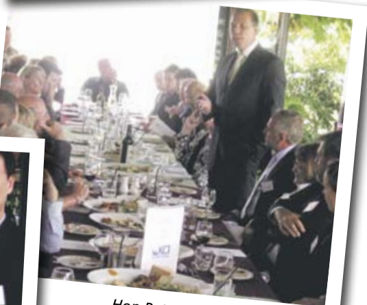
Hon Peter Dutton MP, Shadow Minister for Health and Ageing, addresses attendees of the Diabetes Long Table Lunch.