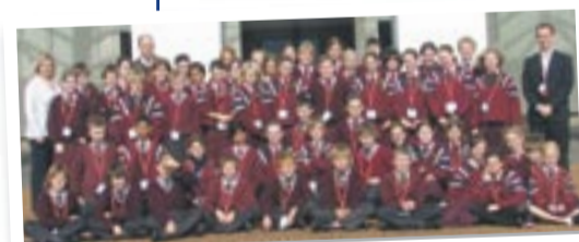
The students standing outside Parliament House in Canberra.

The students from Ellenbrook Christian College were thrilled to be able to experience Parliament House and watch real politics in action.