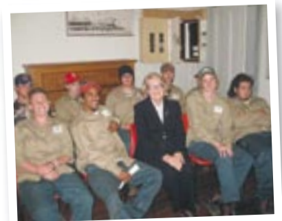
The participants of the York Restoration and Conservation Green Corps project are joined by Judi Moylan at the official opening.

"To date Green Corps participants have propagated and planted more than 14 million trees, collected more than 9500 kilograms of native seeds, completed more than 5000 animal or plant surveys, hosted more than 1000 community field days and have erected more than 8000 kilometres of fencing."