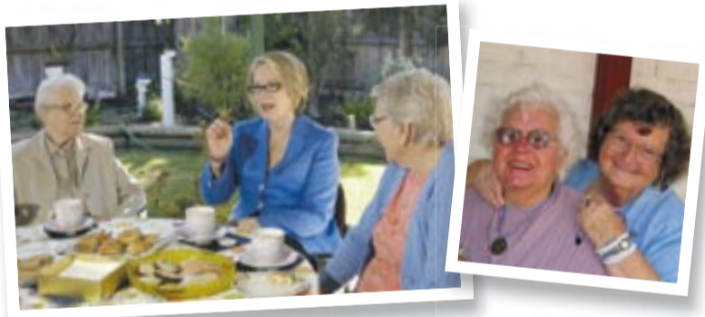
Many seniors and carers living in Pearce are celebrating after receiving a bonus from the Australian Government. Eligible people received payments of $500 or $1,000.

It was Christmas in July for over 17,000 seniors and carers living within the Pearce Electorate who recently received a bonus from the Australian Government.