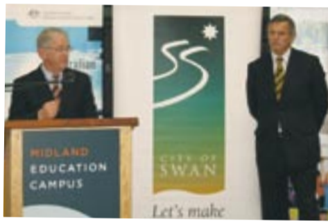
The Minister for Vocational and Further Education, the Hon Andrew Robb AO MP announces the new Australian Technical College as Stuart Henry, the Member for Hasluck looks on.

The new college brings the number of Australian Technical Colleges to 28.