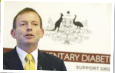
Federal Minister for Health and Ageing, the Hon Tony Abbott MP was a special guest at the Diabetes Futures Forum.