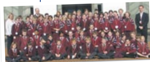
The students standing outside Parliament House in Canberra.

The students from Ellenbrook Christian College were thrilled to be able to experience Parliament House and watch real politics in action.