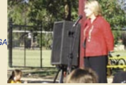
▲ Earlier this year Judi Moylan presented an Australian flag to Bullsbrook District High School (Primary). Judi Moylan regularly presents flags to schools in the Electorate.

• Bullsbrook District High School was allocated $51,707 under the Investing in Our Schools initiative.