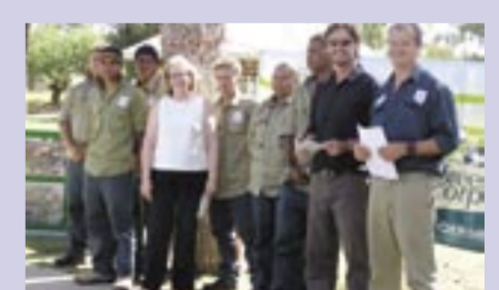
▲ At a Green Corps launch in Northam earlier this year.

• In 2005, $13.78 million was approved for the Avon Catchment Council's Investment Plan 2005-06, by the Australian and State Governments. This extensive scheme will ensure vast environmental improvements are made across the Avon Valley. • Bakers Hill, Northam, Toodyay and York are a few of the Wheatbelt towns which have been connected to Broadband ADSL Internet thanks to the Wheatbelt's Broadband Broker, the Government's former Higher Bandwidth Incentive Scheme (HiBIS) or the new Broadband Connect program.