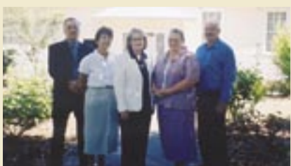
▲ Judi Moylan is often asked to officially open new facilities including Boddington's Rural Transaction Centre, which the Government provided $113,000 towards.

• A Financial Assistance Grant of $348,329 was provided to the Shire of Boddington for local community services and roads. • A grant of $75,000 was awarded under the National Emergency Volunteer Support Fund for the Shire of Boddington to extend its emergency services premises and to construct a training area and parking bays.