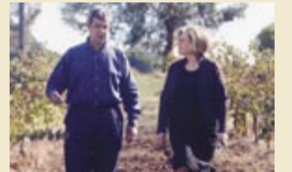
▲ Speaking to a Swan Valley winegrower.

• Upper Swan Primary School received $49,000 through Investing in Our Schools for its Classroom Upgrade project.