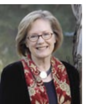
Hon Judi Moylan MP Federal Member for Pearce

Working with you, working for you in Pearce