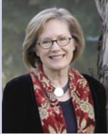
Hon Judi Moylan MP Federal Member for Pearce

The most recent has entailed the concerns of pork producers in the Electorate who are facing tough competition from imports as well as concerns about the spread of disease. Our primary